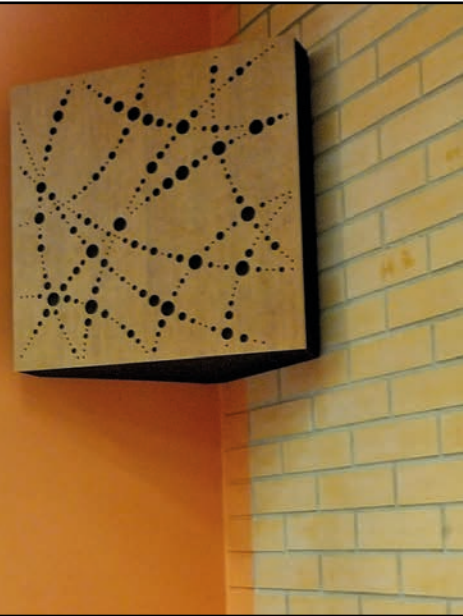
Image of 60x60cm model Ref.:LF0060 (on the left) and Ref.:LF0060 applied (ambient image).