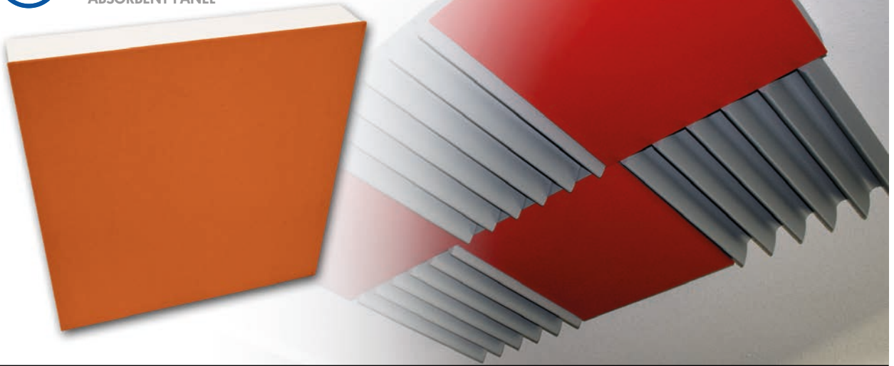
Image of 60x60cm model Ref.:CAM060 (on the left) and Ref.:CAM060 applied (ambient image).