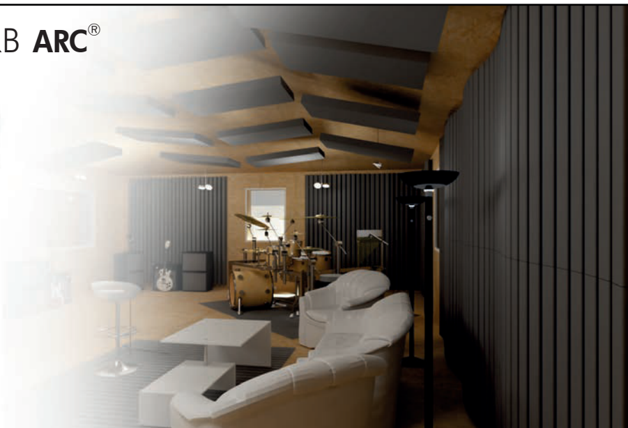
Image of pair of the 60x60cm model Ref.:STS060A (on the left) and Ref.:STS120A applied (ambient image).