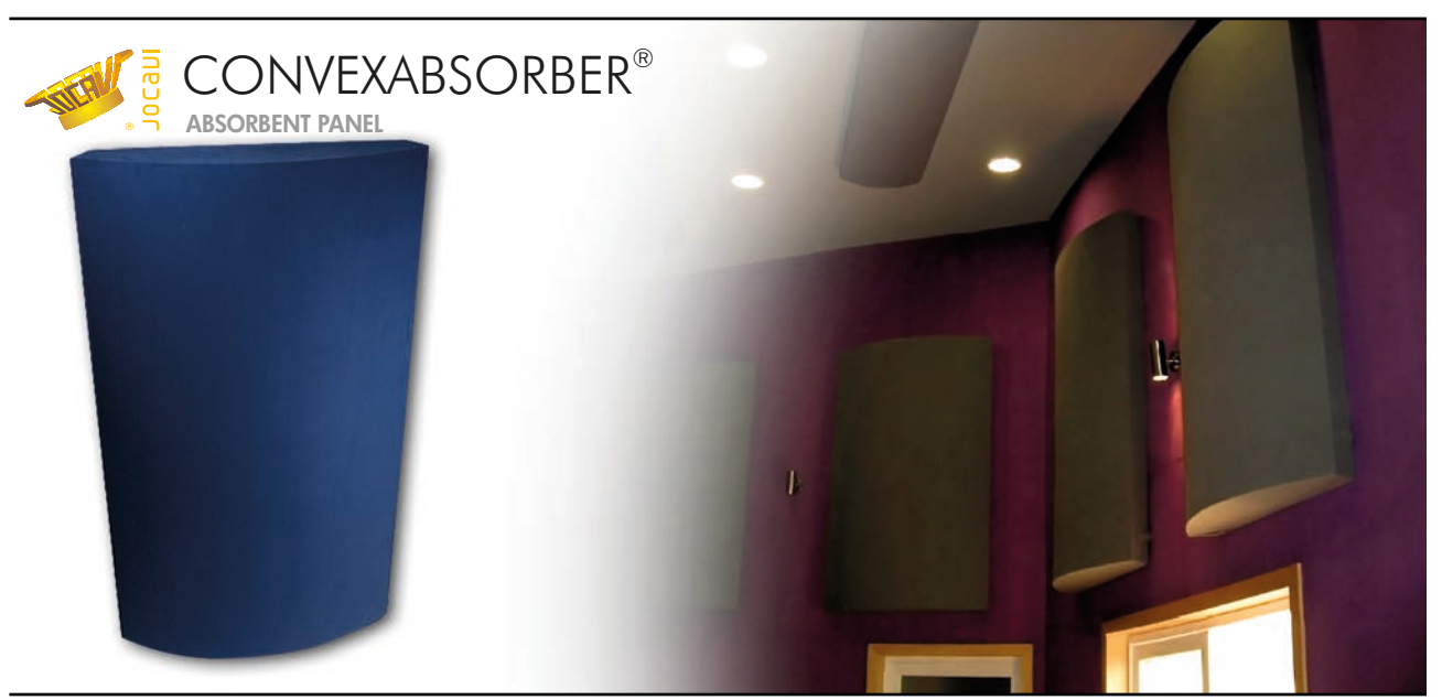
Image of 180x114cm model Ref.:CON180 (on the left) and 180x114cm models apllied (ambient image).