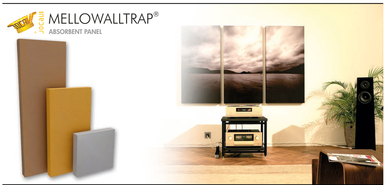
Image of 180x60cm, 120x60cm and 60x60cm models Ref.:MEL180, MEL120 and MEL060 (on the left) and three Ref.:MEL120 models appplied (ambient image) with MOTIF* finishing.