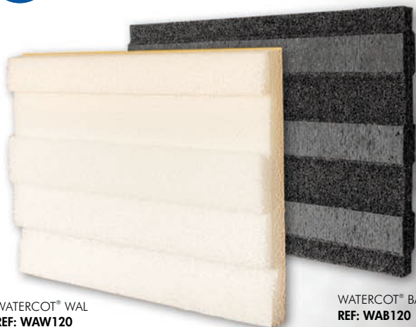
WATERCOT® WAL REF: WAW120