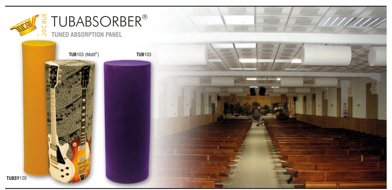
Image of 103xø40cm models Ref.:TUB103 (on the left with and without MOTIF® finishing), 120xø30cm model Ref.:TUBSY120and Ref.:TUB103 applied (ambient image)